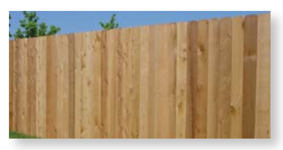
PRIVACY - DOG EAR