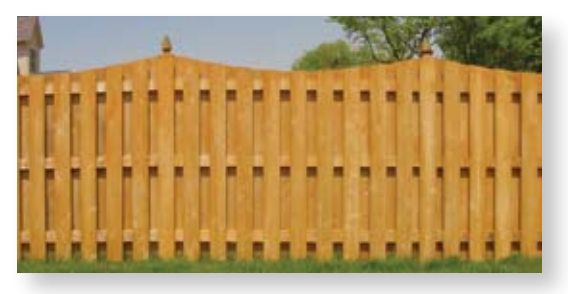
SHADOW BOX - CONCAVE DESIGN